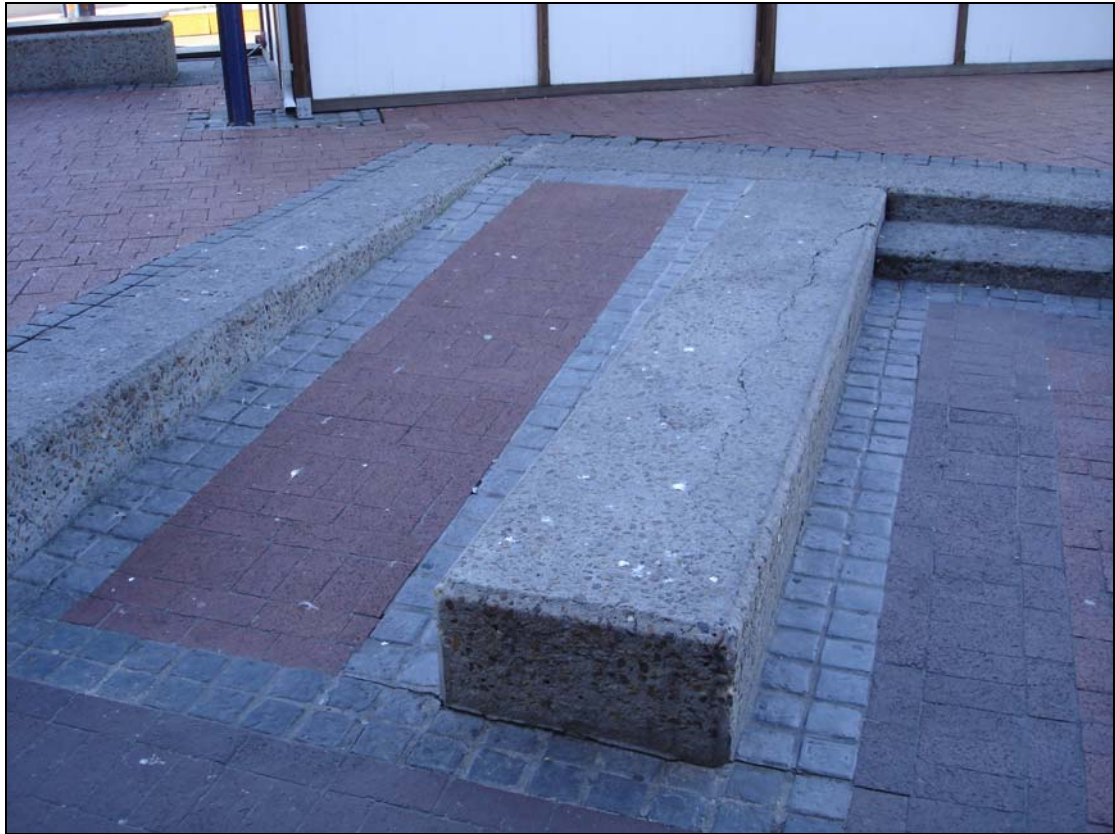
Pictured here is a ramp to afford access to a raised section of ground in the area surrounding the shopping mall.