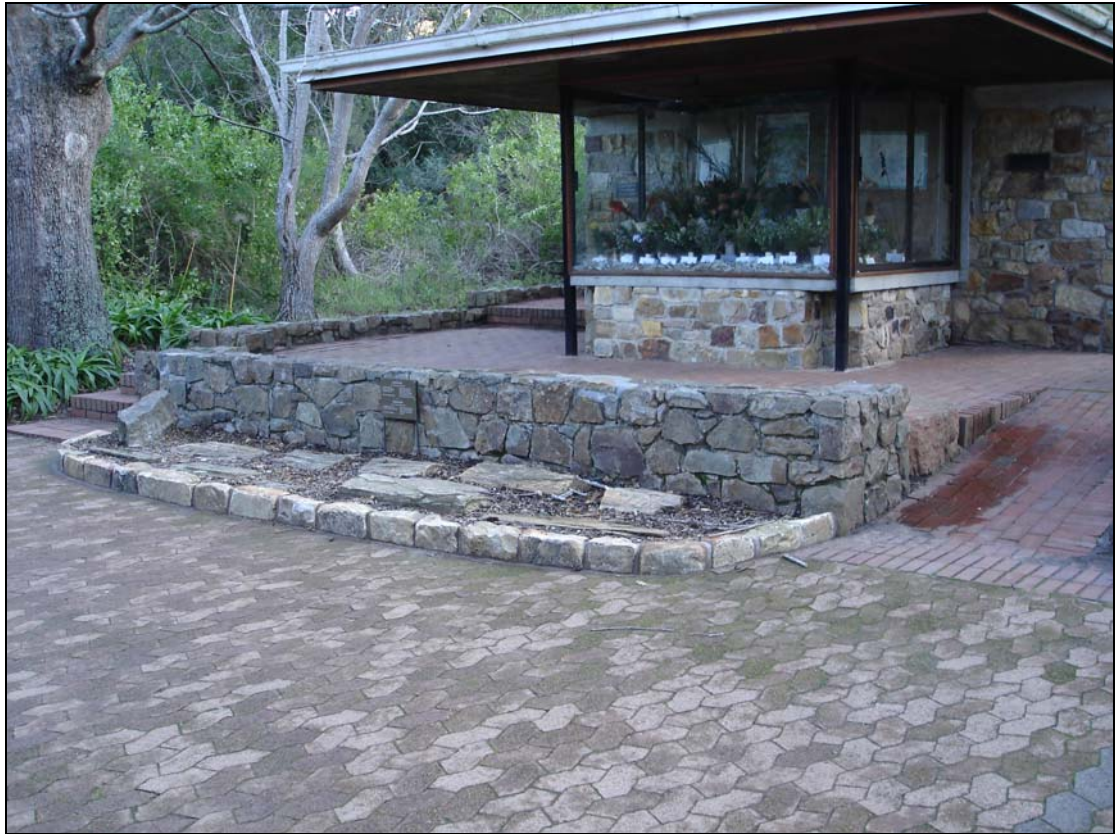
Even a display of the various types of proteas situated on a raised platform has both ramp and stairs.