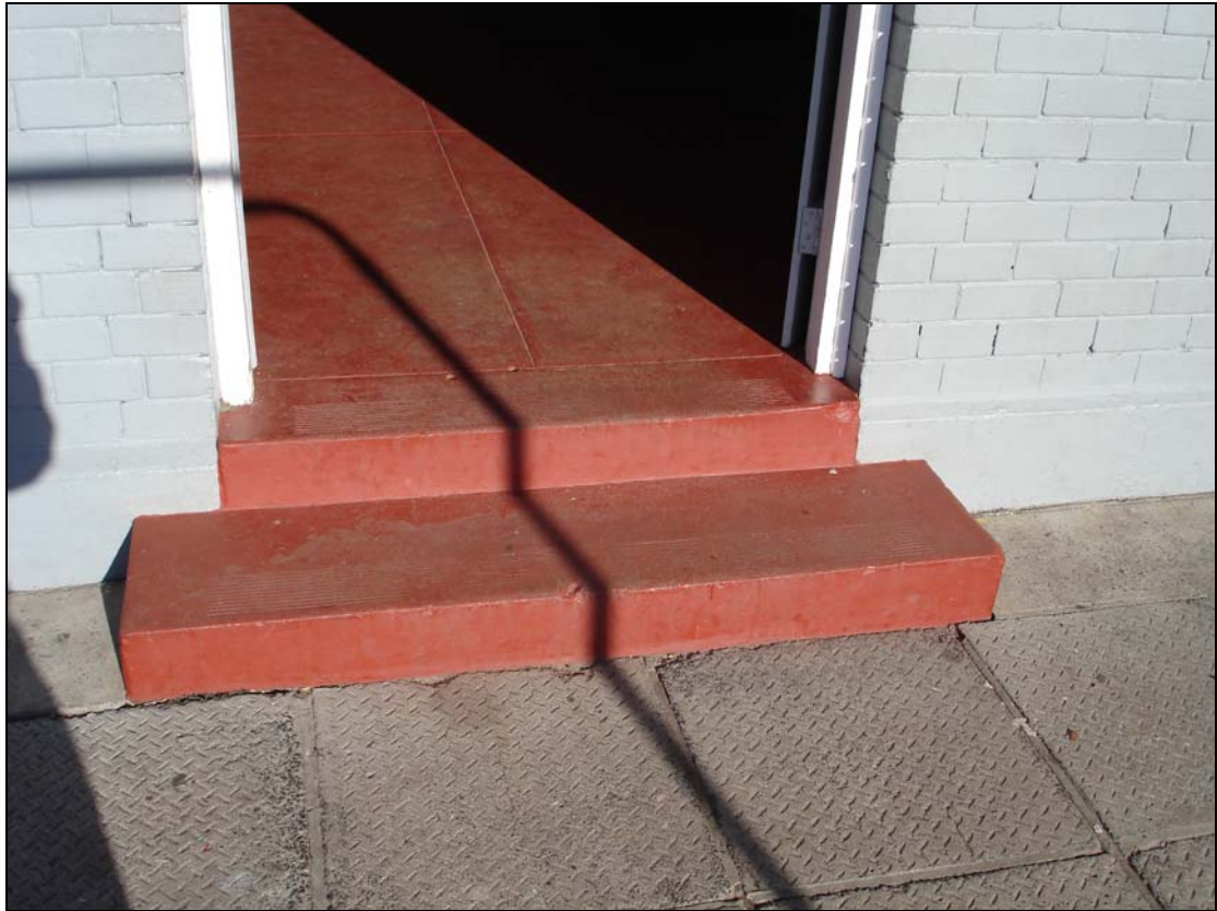
These steps of unequal height hamper entry to the ticket office.