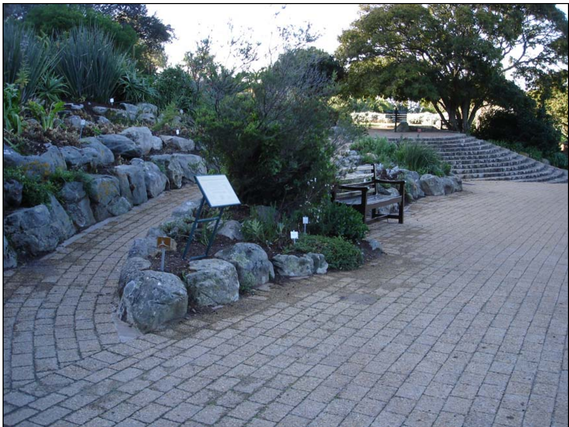
Here again at one of the main entrances ramps are provided at various levels to accommodate people with various abilities or prams.