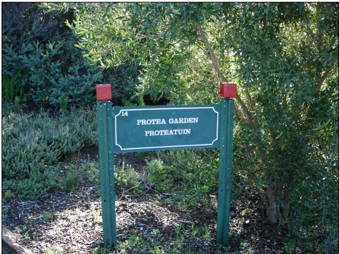
Pictured above is a sign of one of the various sections of the garden. Note the number in the top left, for reference with a guide map available at the information desk.