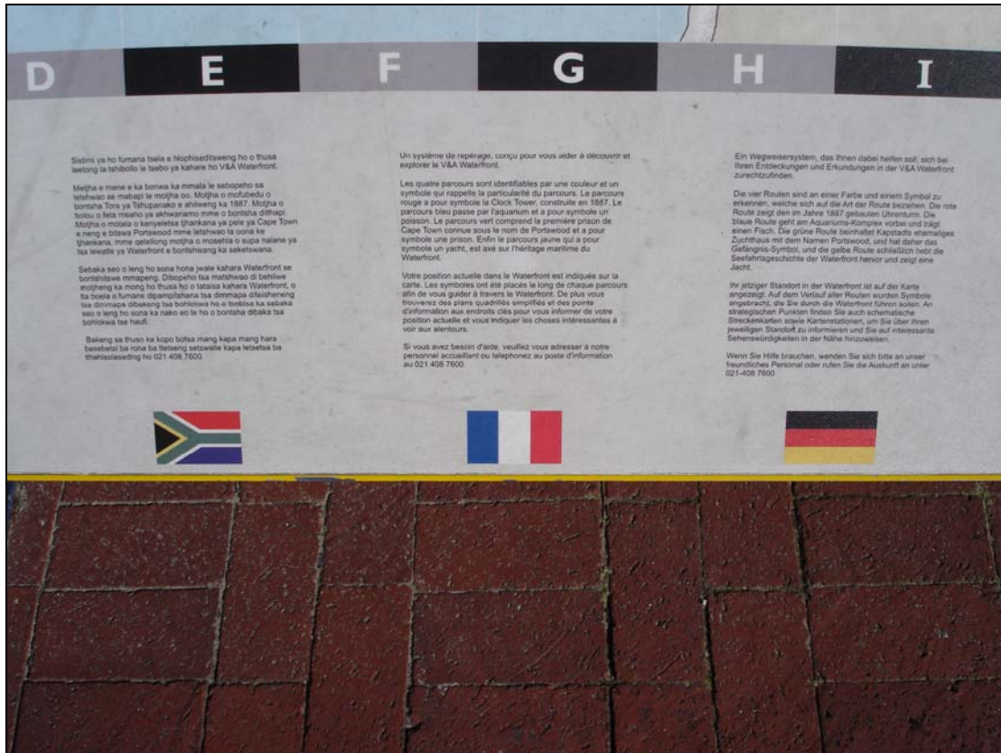
The preceding three photographs show a signage system employed to help individuals navigate around the waterfront, following one a few predefined routes. Each route has its own icon of differing colour and is easily identifiable.