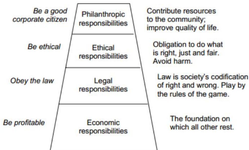
Figure 2.2: Carroll's pyramid of CSR (Visser, 2004:34)

According to Visser (2004:34), Carroll's American CSR pyramid takes a different form in South Africa. The American CSR pyramid is shown in Figure 2.2 and the South African one in Figure 2.3 below. Both countries still maintain highest level of economic responsibilities, however, instead of legal responsibilities aspects in the second place, philanthropic responsibilities is maintain by South Africa followed by legal and ethical responsibilities.