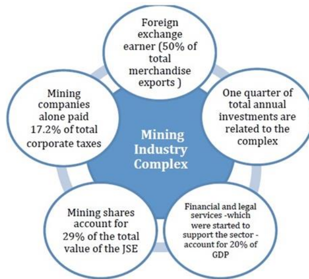
Figure 4.1: The mining industry's ways of contributing to the economy